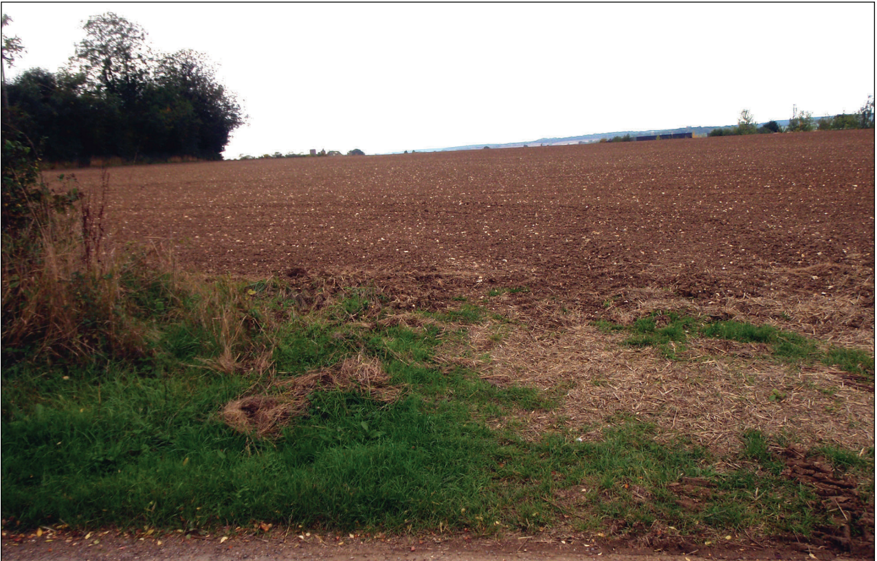
Plate 1: Site from the north looking south with Shire (Shere) Hill Farm in distance