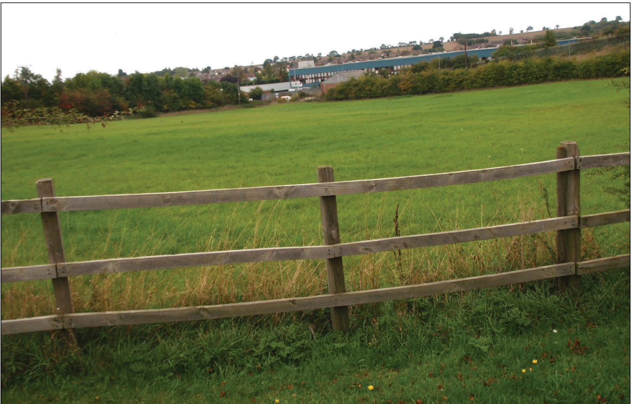
Plate 2: Pastoral Field adjacent to Radwinter Road looking north-west with industrial estate in distance