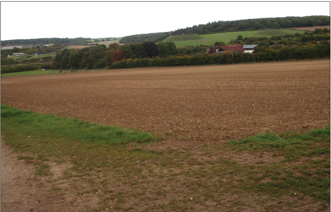
Plate 4: Site from the south looking north-east with Turnip Hall Farm in distance