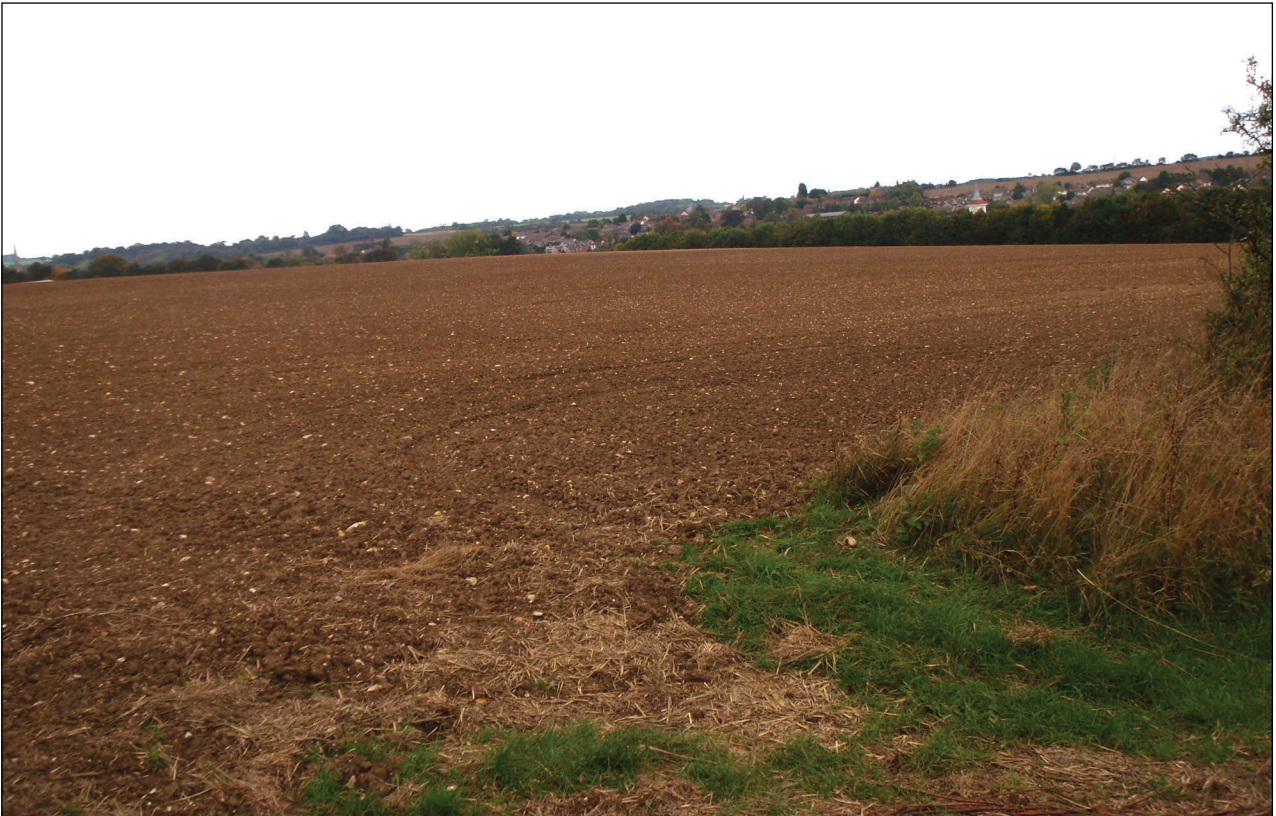
Plate 3: Site from the south looking north-west with Saffron Walden town in distance