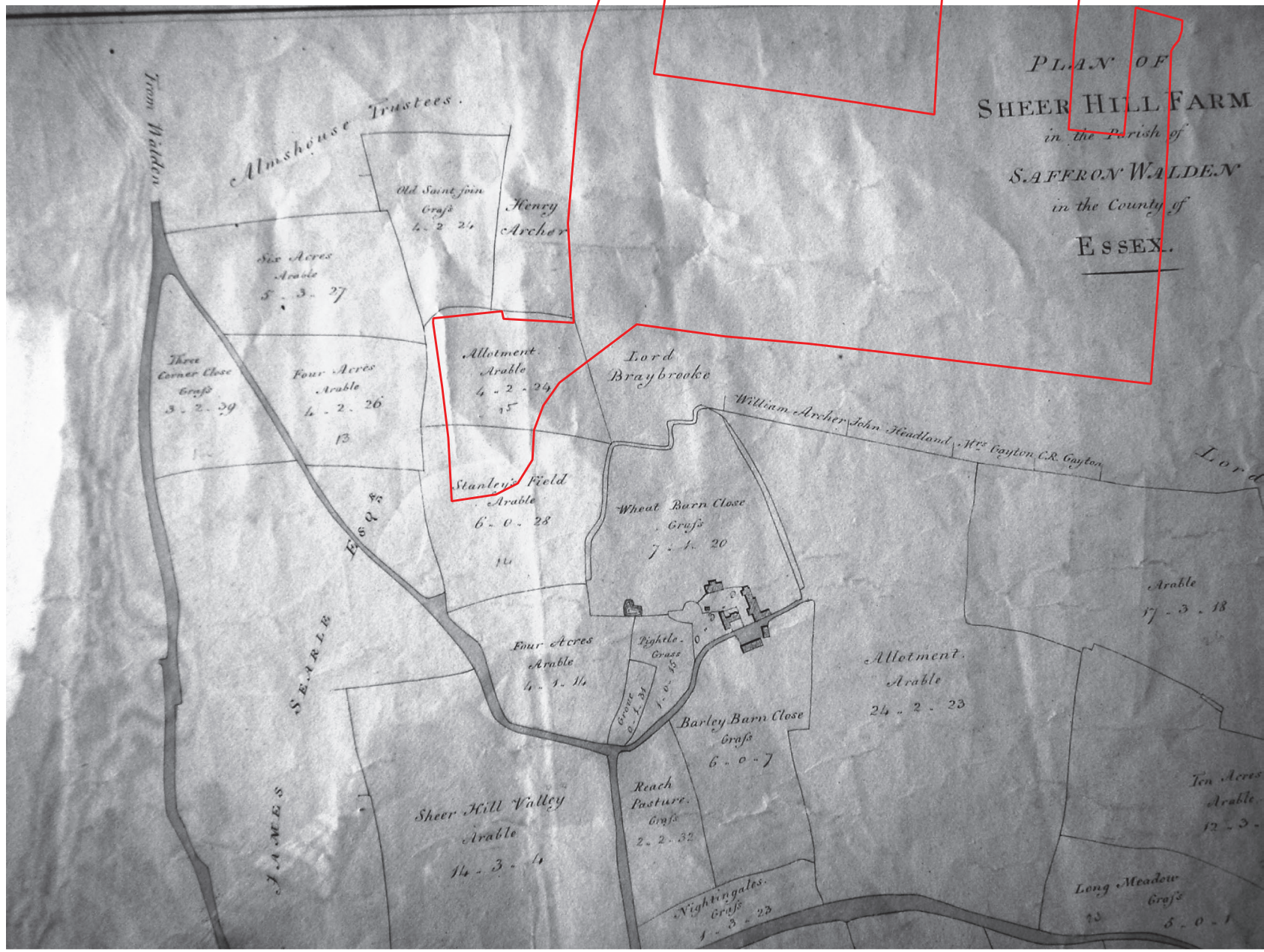
Figure 7: Plan of Shire (Sheer) Hill Farm (1850)