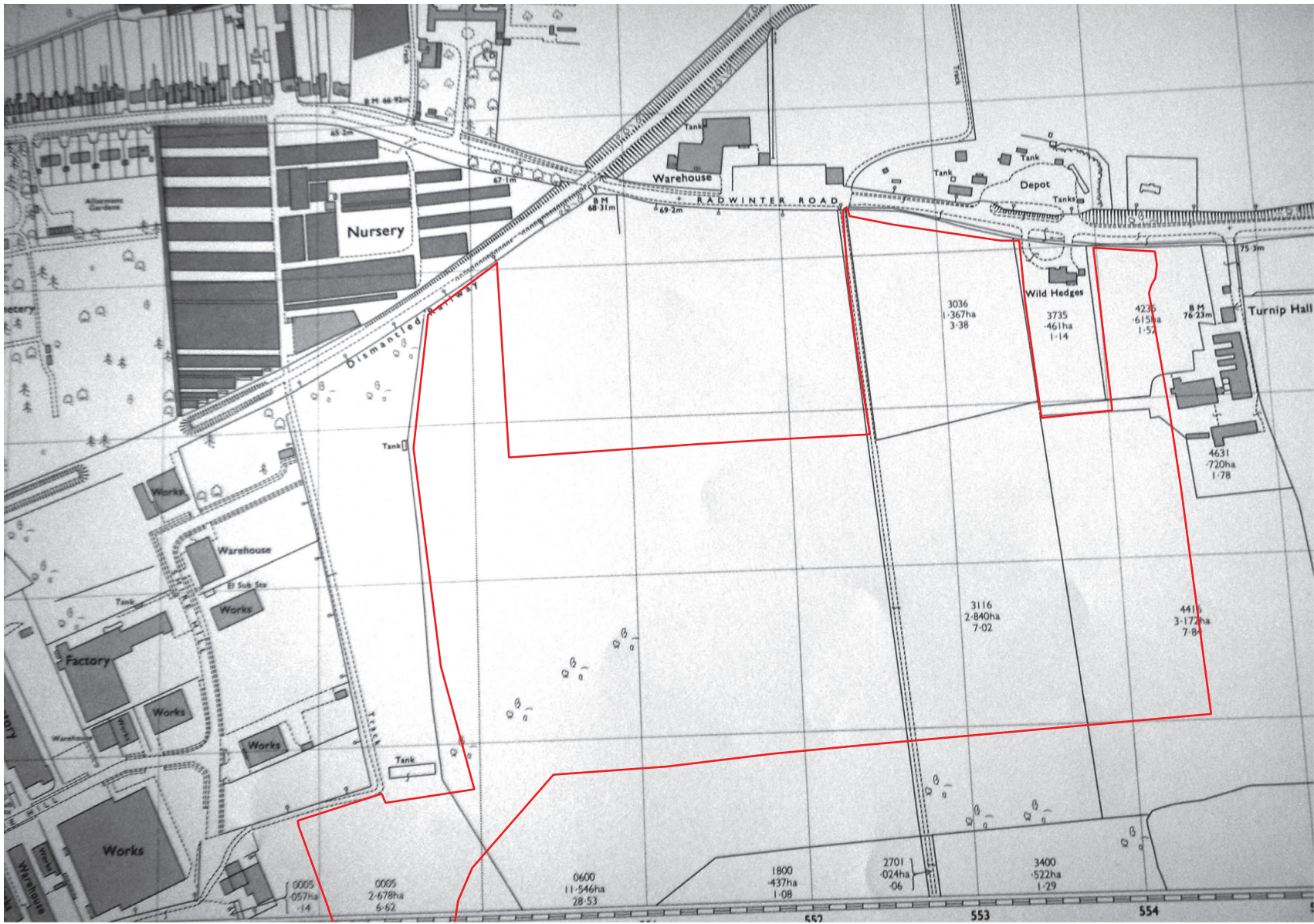
Figure 9: 1970 Ordnance Survey map