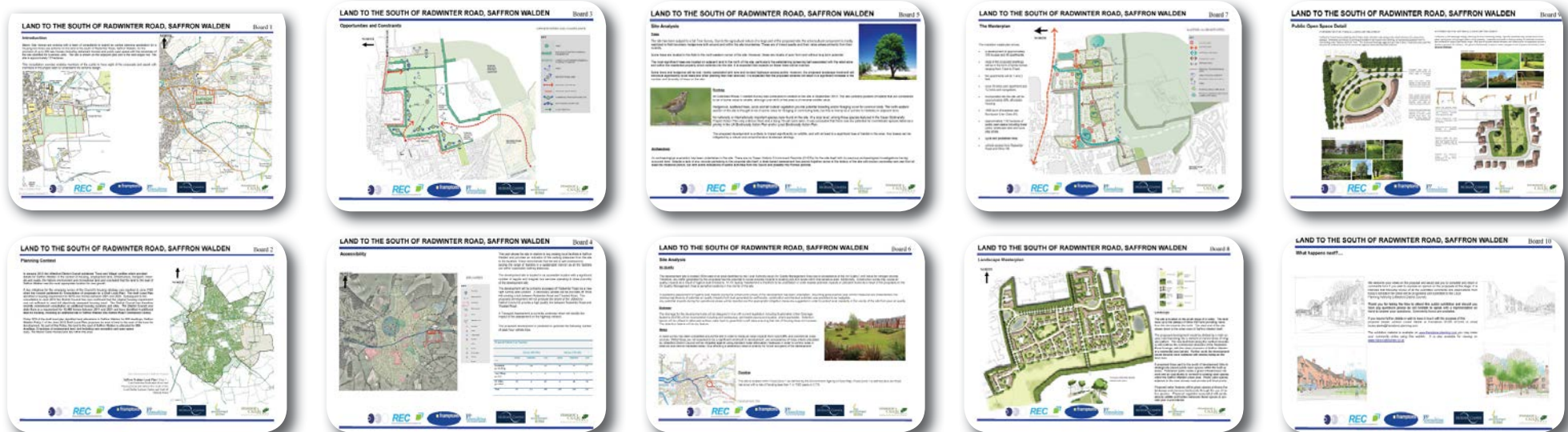
Fig 15: Boards from the public consultation