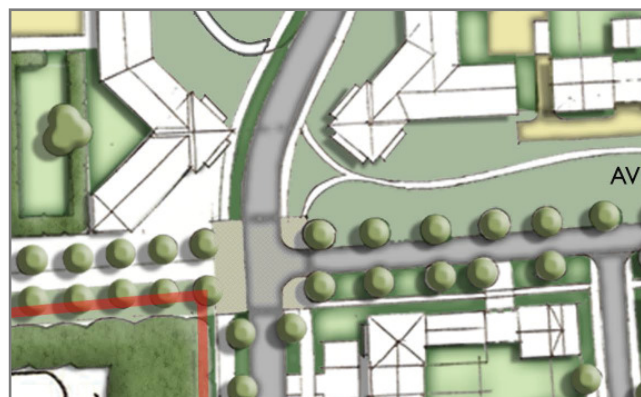
Fig 13: Movement extract from masterplan