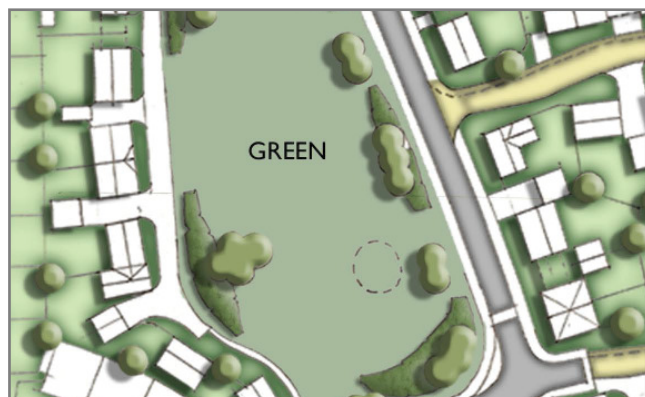
Fig 12: Green infrastructure extract from masterplan