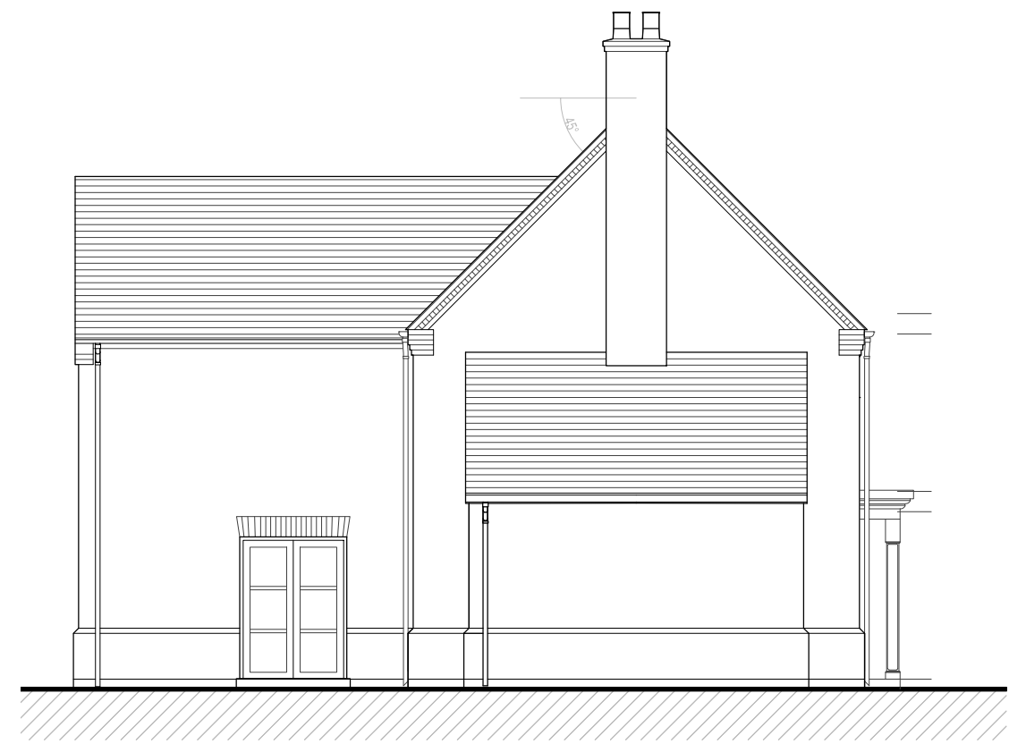
LEFT FLANK ELEVATION