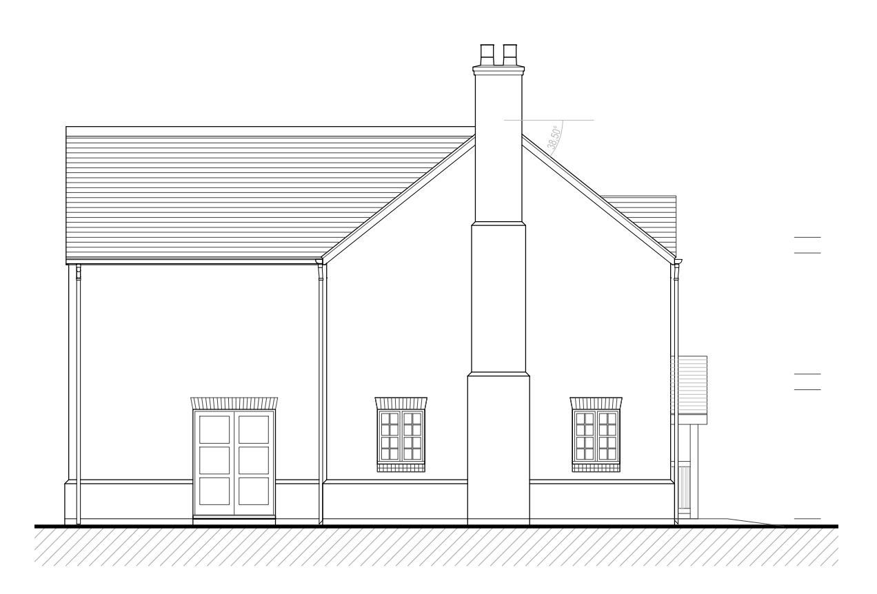
LEFT FLANK ELEVATION