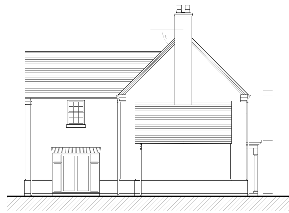
LEFT FLANK ELEVATION