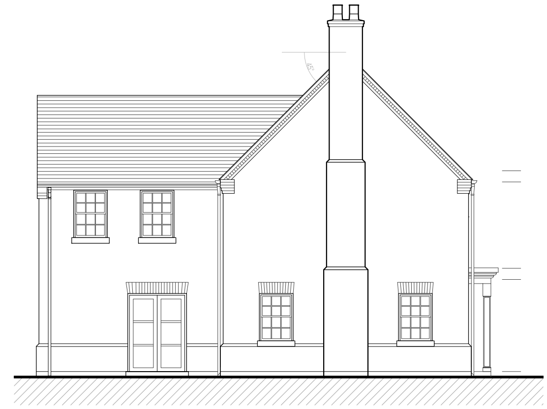
LEFT FLANK ELEVATION